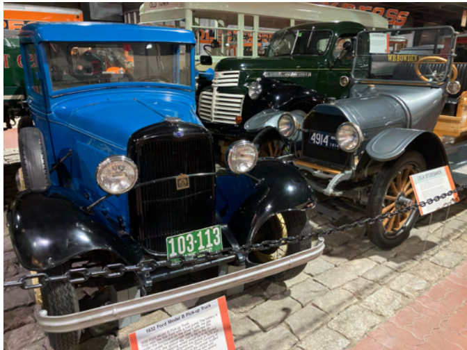
1932 Ford Model A Pick-up Truck